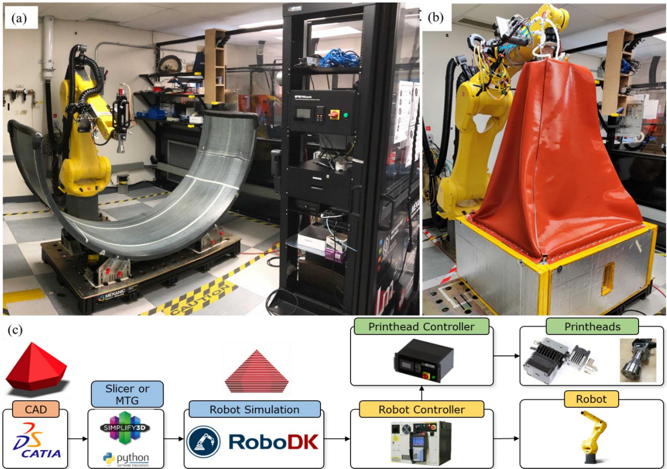
Figure 1. (a) Photo of the AM infrastructure for nonplanar multinozzle AM of thermosetting materials on the inner surface of half an aircraft engine fan case, (b) Photo of the AM infrastructure with a custom-built heating enclosure for FFF printing of high temperature resistant thermoplastics, and (c) Workflow of the robot motion system customized for multinozzle printing of thermosets and FFF printing of thermoplastics.

resulting intersection lines are collected to generate the outline toolpaths. Once a G-code file is generated for the specimens, it is imported into the robotic simulation software (RoboDK, ver. 5.4.1) to solve the inverse kinematic problem for each coordinate of the toolpath [12].